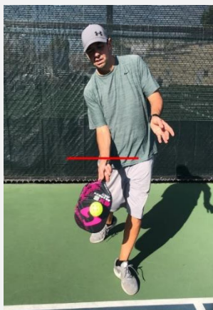
Figure 4-1 (legal serve)