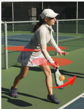
Figure 4-3 (legal serve)